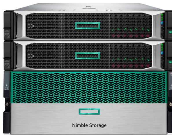
HPE Nimble Storage dHCI

With HPE Nimble Storage dHCI, enterprises can run faster with rack-to-apps in less than 15 minutes, end the fire-fighting with predictive analytics delivering 99.9999% data availability by HPE Nimble Storage, and optimize everything with higher productivity and maximum resource efficiency.